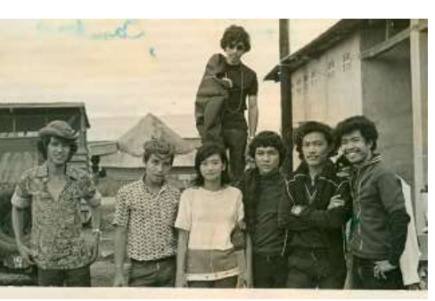
The Eagles 5 Band, played at the Cuchi standdown - I remember getting on stage and singing with them.jpg (320x210)