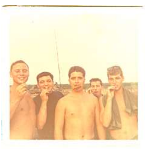
At the Hard Spot, near Dau Tieng mortar platoon early 1969.jpg (240x240)