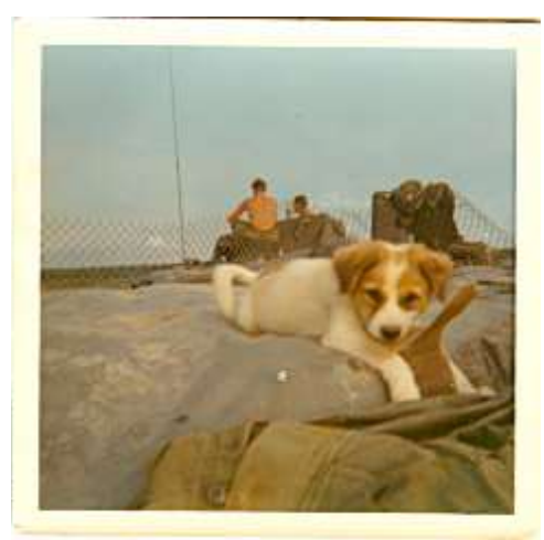
A dog we had at the Hard Spot near Dau Tieng early in 1969, We named this mascot ZigZag.jpg (243x240)