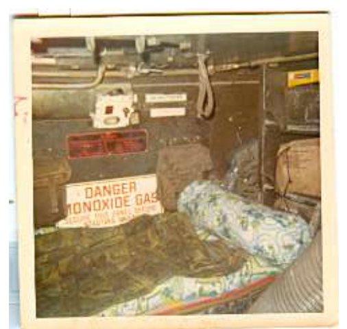
Bed in 4-1 track.jpg (245x240)