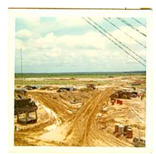
Fire Support Base Stoneman at least thats the name I wrote on the back of the picture 40 years ago.jpg (240x240)